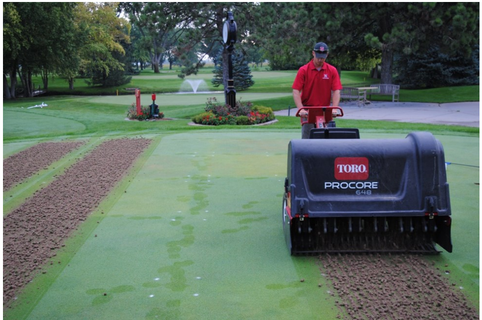
Figure 1. Yellowing from Bensusmec when applied after season-long Velocity or Trimmit in NE. Picture taken 3 September.

Annual bluegrass ( Poa annua ) is the most troublesome and probably the most studied weed on golf courses throughout the United States. Though many labeled active ingredients exist for fairway height turf, few labeled options exist for greens height turf. Our most recent study over three states and four years indicated the efficacy of season-long treatments varied between locations and years. Paclobutrazol (Trimmit 2SC™), flurprimidol (Cutless), or bispyribac sodium (Velocity 7.16SP™) were the most effective reducing Poa annua depending on location, and control decreased at each location in later years. We cannot rely on a single herbicide or growth regulator for long-term control of Poa annua , and thus this study evaluates management systems of multiple active ingredients, iron sulfate, and summer vs traditional fall hollow tine aerification. We also included the latest potential Poa annua herbicide, methiozolin (PoaCure™).