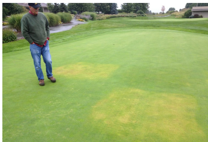
Figure 2. Yellowing from late-August- applied Bensumec after season-long Velocity in IN. Picture taken 15 Sept.