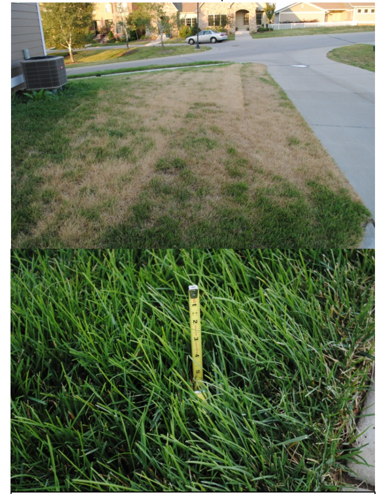
Figure 3 (top): Frequent watering immediately after sod installation is essential. Since sod may take months to root adequately, monitor for soil moisture and drought stress in the plants.

Regular fertilization will also help the plant develop a healthy root system. Apply the same starter fertilizer used prior to sodding at 1.0 lbs P<sub>2</sub>O<sub>5</sub>/1000 sq ft at four to six weeks after sod laying and again eight to ten weeks after sod laying to limit nitrogen deficiency, which usually manifests itself as thinning and older leaves turning yellow. If sodding in late summer and soils have adequate phosphorus levels, forego starter fertilizer in favor of traditional high N fertilizers. In mid-September and at least