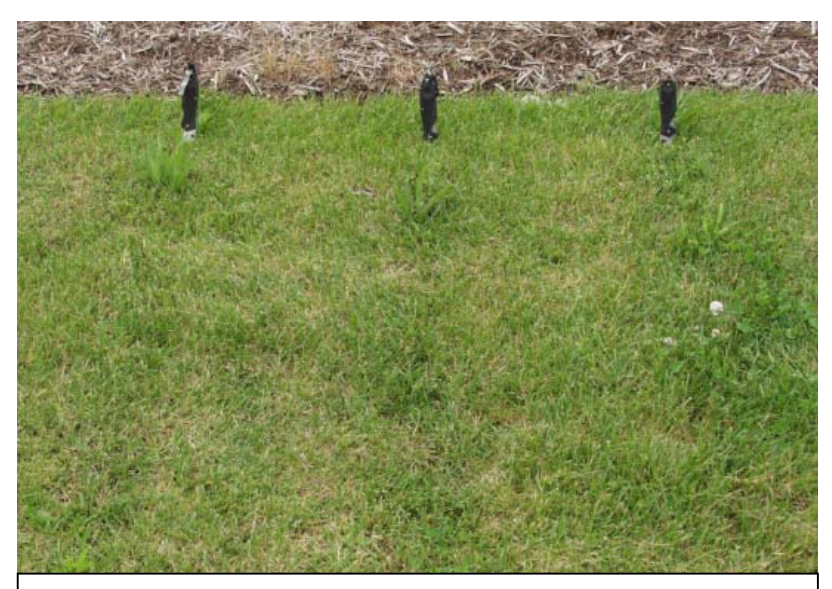
Figure 1. Sod will naturally shrink when it dries. Maintaining tight seams when laying will minimize future weed problems and rough mowing surfaces.

Use a tiller or other cultivation equipment to work the soil to a depth of 4-6 inches, incorporating fertilizer or other soil amendments. To help improve a clay soil,