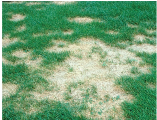
Figure 1. Symptoms of summer patch in Kentucky bluegrass. Note irregular areas of dead turf.