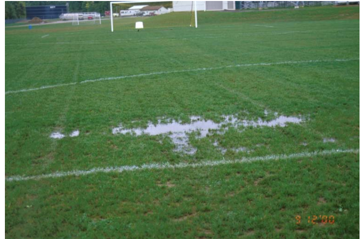
Figure 2. Establishing a grade with up to 2% slope is critical for the fastest surface drainage to allow for use shortly after rain storms. Poor grading on this relatively new field has left depressions that hold water that will eventually thin turf.

It is critical to establish adequate surface drainage on an athletic field. Without proper surface drainage, depressions will gradually develop that will hold water, make it difficult to maintain turf, and possibly risk injury to players (Fig. 2). Though most coaches and players prefer to have a perfectly flat field, this is only possible with an expensive sand field. A 2% slope is preferred on most turf areas, but a 1.0 to 1.5% slope is acceptable on native soil fields if used only occasionally. For native soil fields, it is imperative to have at least a 1.0 to 1.5% slope from the centerline of the field to both sidelines. This will make a crown from 9 to 18 inches at the center of the field depending on the