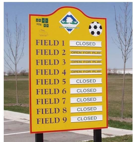
Figure 1. It is critical to rotate play around fields in order to allow fields to recover from damage.

Regulation size athletic fields range in size depending on the athletes' age level. A complete list of field dimensions is available at the Sports Turf Manager Association's web page http://www.stma.org/field-dimensions . When building athletic fields, it is important to plan extra fields if possible to rotate play allowing turf to recover from damage (Fig. 1). Another alternative is to make fields and surrounds large enough and with borders to rotate direction of play. For example, if a practice field runs north-south, allow enough space to rotate the field 90 degrees, creating two parallel fields that run east-west. Avoid permanent fixtures like bleachers, goals, and observation platforms to allow flexibility in use areas. This strategy spreads out turf wear on the heavy use areas like goal mouths and sidelines. Dedicated practice areas and parking should also be taken into consideration when planning athletic field complexes.